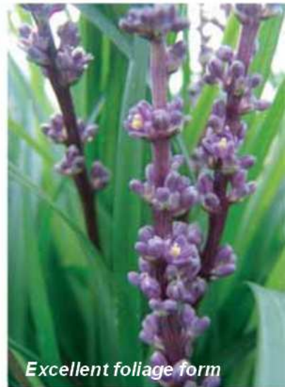
Excellent foliage form

In colder climates like Melbourne, Canberra or Christchurch, it is a good idea to trim the foliage back each year in mid to late winter, allowing the crisp new shoots to emerge without the clutter of older leaves. On larger projects this may not be possible, but don't worry, by spring or summer the new clean foliage will dominate the old foliage, giving the plant a refreshed look.